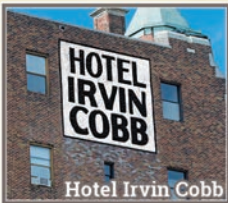
Hotel Irvin Cobb