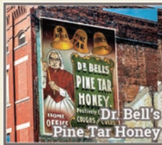
Dr. Bell's Pine Tar Honey