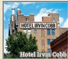
Hotel Irvin Cobb