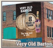
Very Old Barton